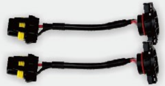
● TWO ARTICLES CONNECTING WIRE