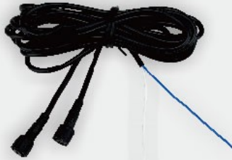
● CONTROL WIRE(1to2)