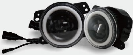
● A PAIR OF LED FOG LIGHT